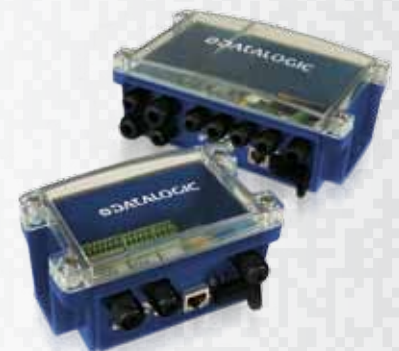
AL5010 INTERFACES MODULE