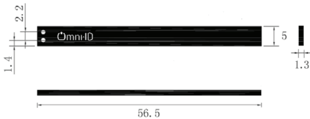
Dimensions stated in mm