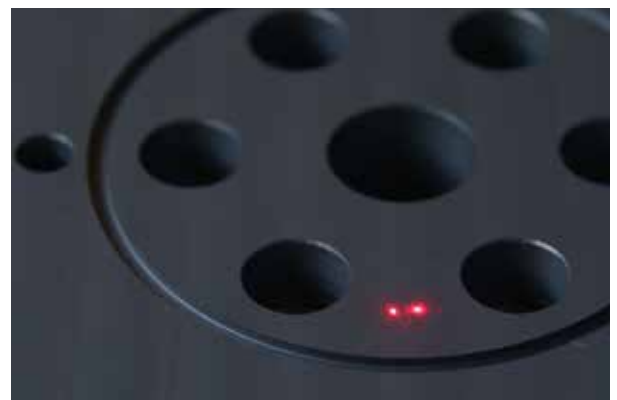
Twin beams for easy focus finding