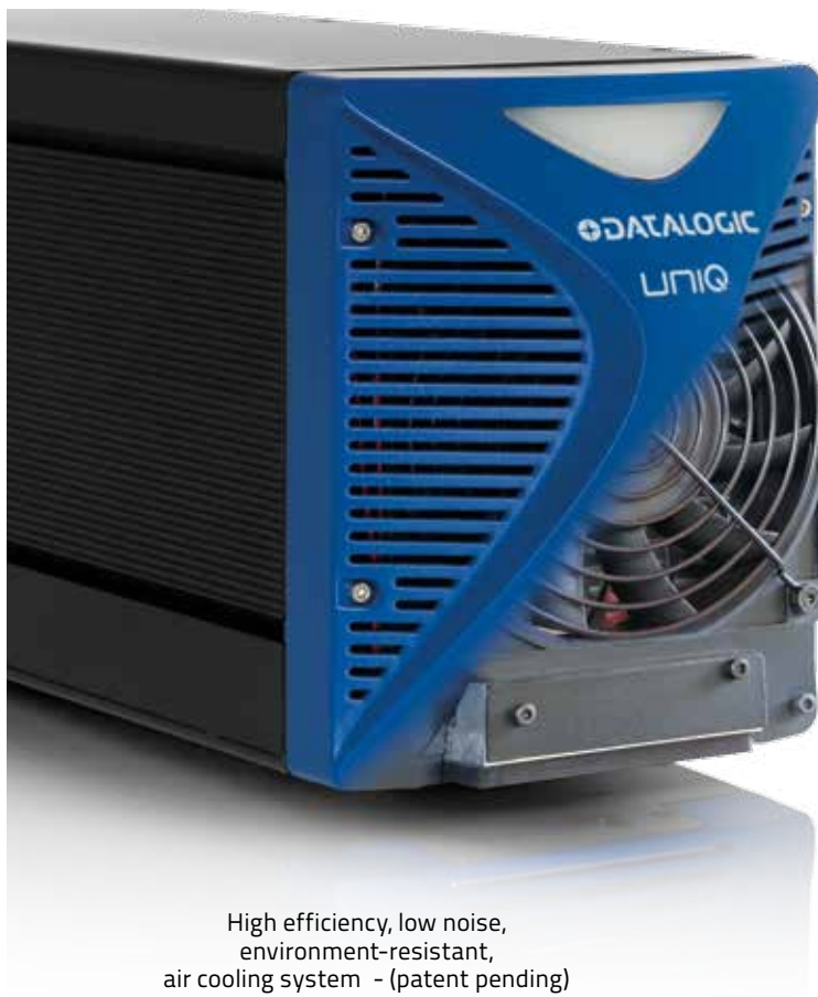
High efficiency, low noise, environment-resistant, air cooling system - (patent pending)

Laser interaction with organic or inorganic material can cause TOXIC FUMES/PARTICLES. The OEM laser components described in this product guide is for sale solely to qualified manufacturers, who shall provide interlocks, indicators and other appropriate safety features in full compliance with applicable national and local regulations.