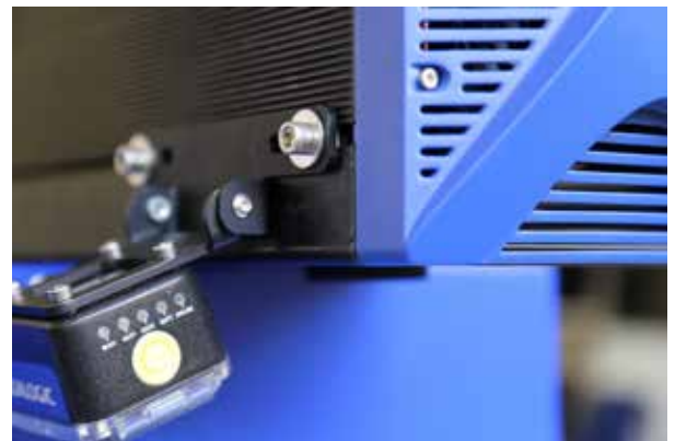
EasyFix mounting rail for accessories