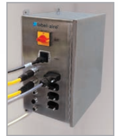
Remote Mounted Electronics